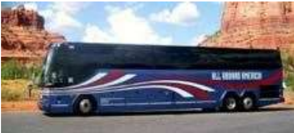
Note: Actual color scheme may vary.